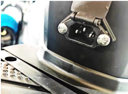
Bike entry for charger